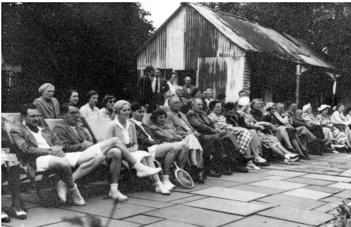
Finals Day 1951 showing the old clubhouse before it was rebuilt later that year

On the day before Finals Day in 1947 a disastrous fire broke out in the pavilion and by the time the Fire Brigade had arrived and got its hoses working from Gloucester (Galsworthy) Road, most of the building had been raised to the ground and the entire contents destroyed. However, as usual, the members rallied round and produced furniture, crockery and tents to make Finals Day – and tea – the success it always was, with over 100 people attending.