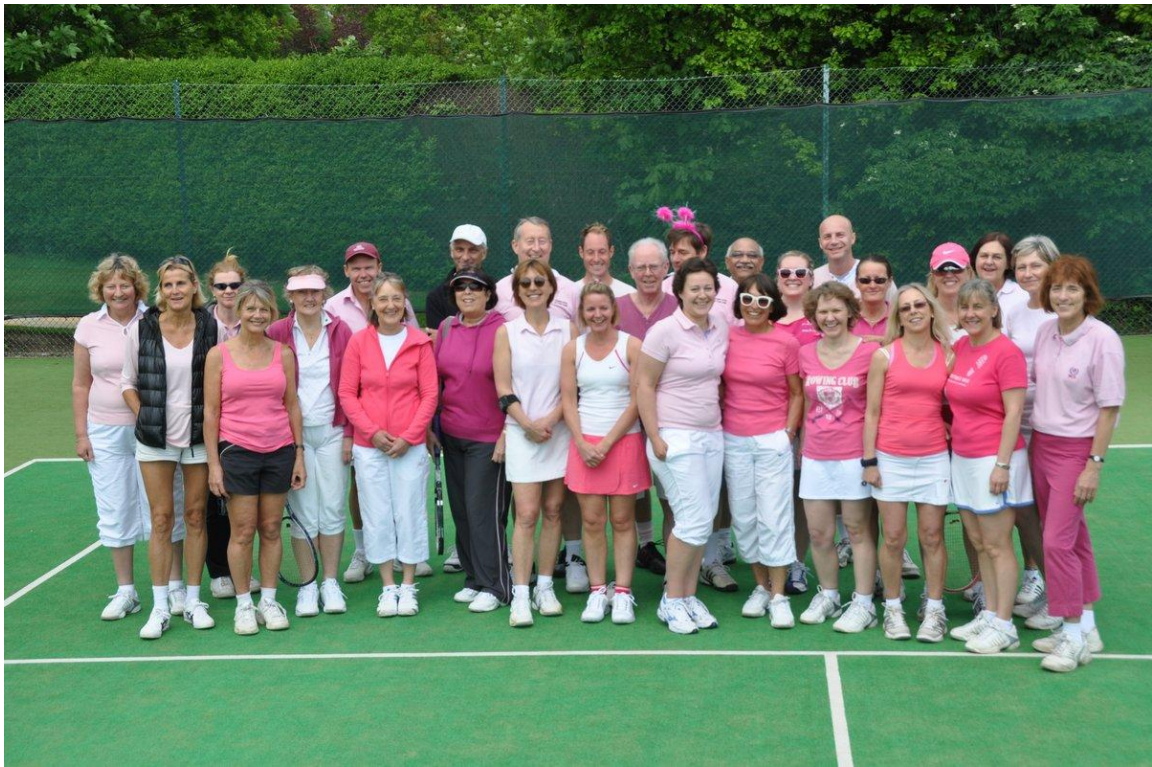
A Breast Cancer Campaign charity day at Coombe Wood 2012

Throughout the years, it has been the dedication and commitment of the members – particularly the committee – that has driven the club forward to the success it now enjoys. Unlike some clubs in the area, Coombe Wood continues to thrive with 300 senior playing members and nearly 400 juniors, so it has been necessary to instigate a waiting list for the first time. The members are now looking forward to the Club's centenary in seven years' time.