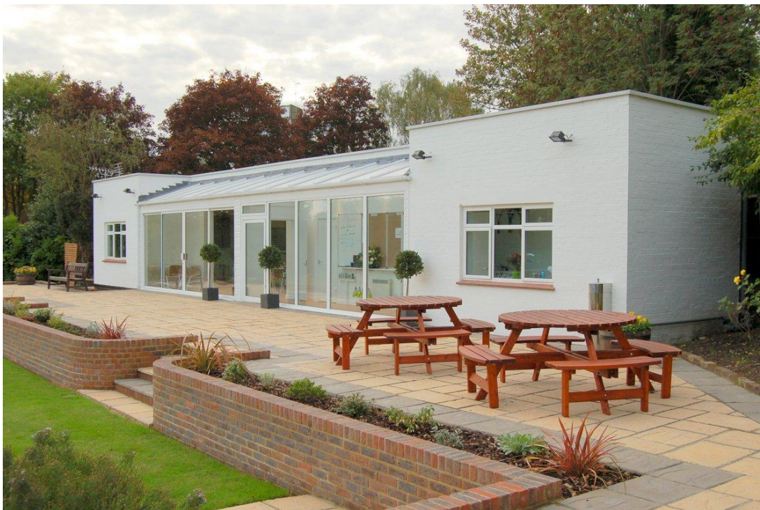
The new Clubhouse