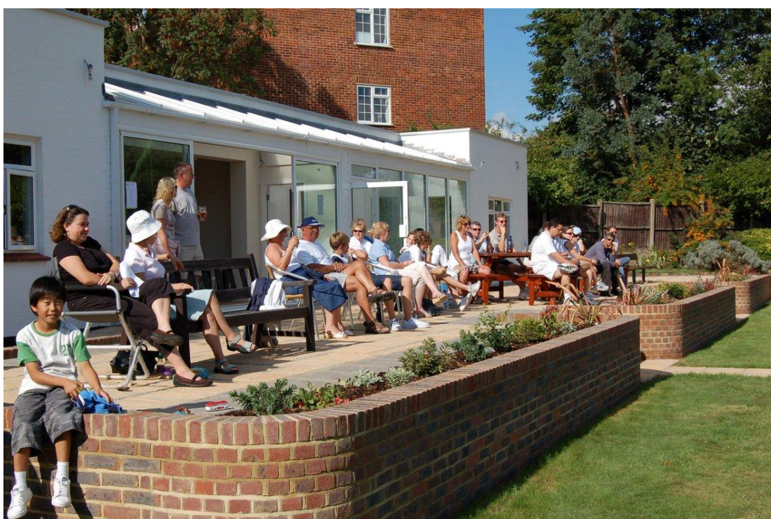
A social afternoon at the Club

In 2002 Sport England introduced Clubmark to provide a focus around which all organisations involved in sport for children and young people can come together in support of good practice. In 2008 it was felt that Coombe Wood should work towards achieving Clubmark. The Club was accredited in 2010. One of the requirements was that the Club should have a five-year plan for future development and, initially, this included: