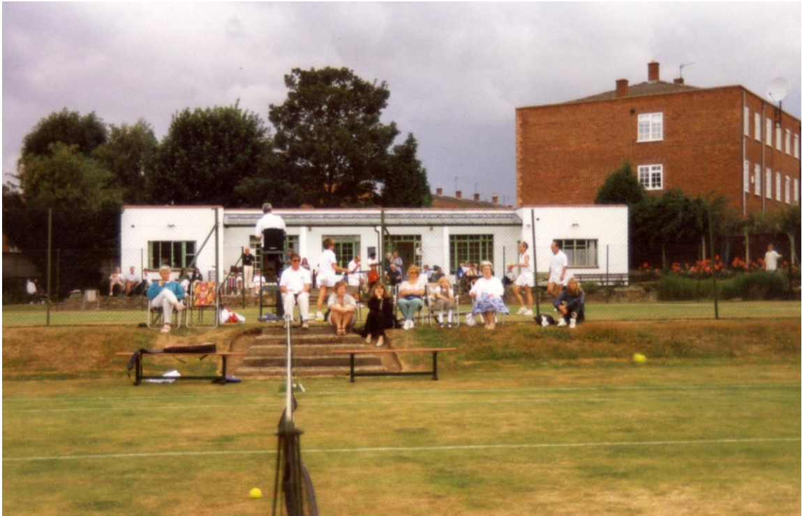
The clubhouse after the 1956 alterations

through. For the first time the Club had running water in the kitchen and electricity to replace the oil lamps. A Dr Barnardo's Home, in what is now Blenheim Gardens, allowed the Electricity Board to run the necessary cable down its boundary from Gloucester (Galsworthy) Road to the back of the clubhouse – about one third of the distance of bringing it down the lane – which greatly reduced the cost. The following year a small wooden hut, which had served as a kitchen, was transformed into a bar and the Club's first licence to sell alcohol was acquired. During the winter of 1955/56 the Clubhouse was further improved by incorporating the bar into the main building and updating the changing rooms.