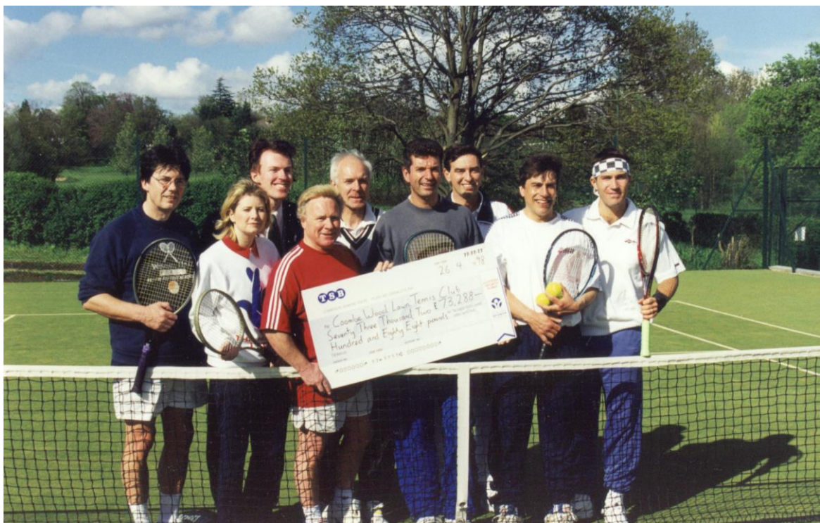
The inauguration of the artificial grass courts, 1998

In 1992, floodlights were introduced on Courts 6 and 7 and it was proposed to change the three grass courts to artificial grass. This naturally caused a stir amongst some of the members who felt it would totally change the nature of the Club. However, a vote was taken at the AGM and the change was agreed. It was necessary to raise money in order to make these major changes so the Club successfully applied for a Lottery grant and also took out a loan from the LTA of £25,000. Work started in 1997 to lay the artificial grass and put floodlighting on Courts 2 and 3. In the summer of 1998, the courts were formally opened and an exhibition tournament was arranged which included Pat Cash, John Inverdale, David Hamilton and Tony Hawks. The artificial grass proved to be both popular and practical as it meant that more members could play all year round and maintenance costs were greatly reduced.