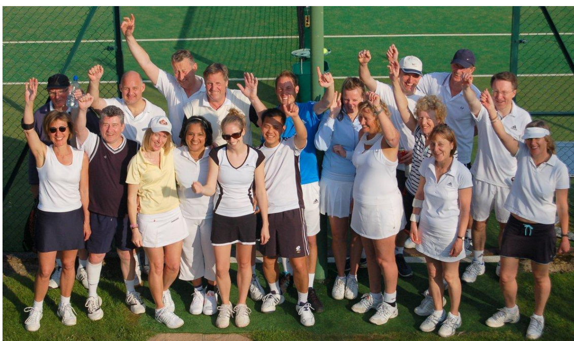
Some Coombe Wood members after the first Winter Tournament final in 2010

In 2008, an opportunity arose for Club Members to learn to play bridge. Classes were organised and proved so popular that it was decided to hold regular duplicate sessions at the Club on a Tuesday evening during the winter. In the summer months, when the Club is busier, the bridge moves to the Minima Yacht Club. In order to make the regular duplicate sessions viable, a few non-members were invited to join in. As the bridge became increasingly popular, those non-members who wished to play on a regular basis were offered the opportunity to become 'Bridge Members' of Coombe Wood and this additional category was added to the membership in 2011.